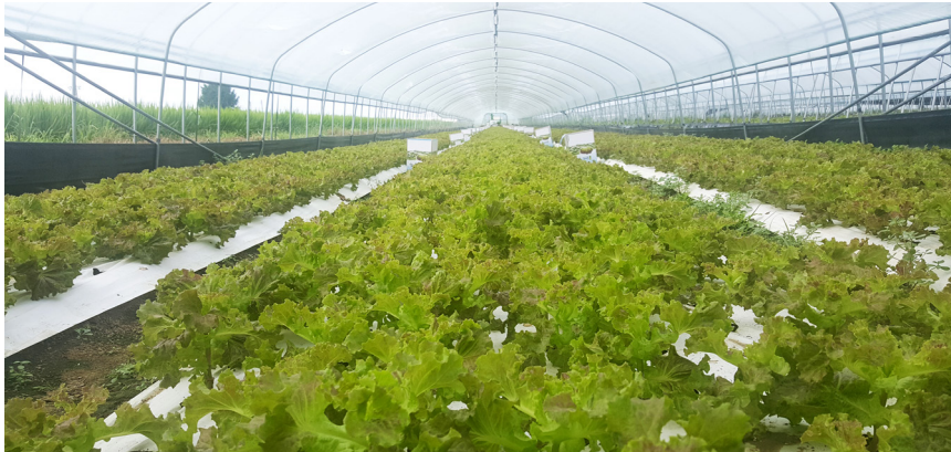
Breathable Film : Leafy vegetables