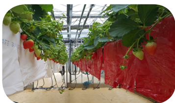
PP Foam Film : Strawberries